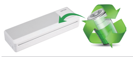
● 7.4V/2600mAh battery