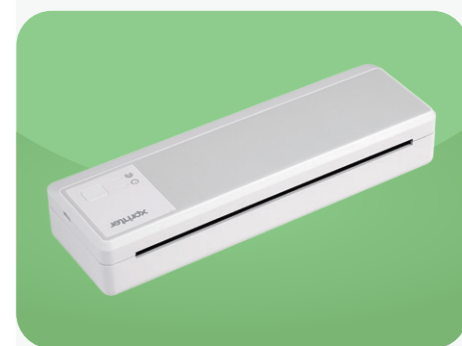
Compact & Portable