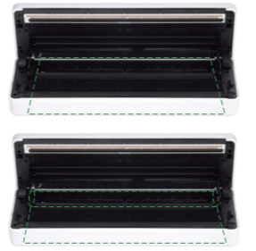
● Paper bin structure, flush in/flush out structure