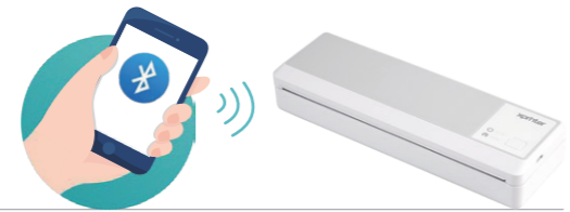
● Support Android, IOS, Windows, Mac