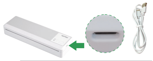
● Type-C USB charging