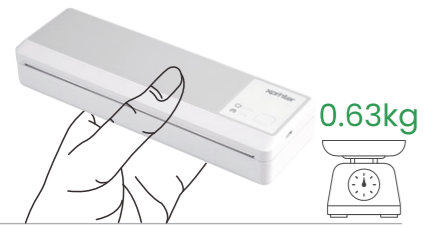
● Lightweight, portable