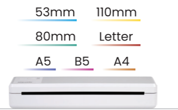
● Multi-size free switch printing