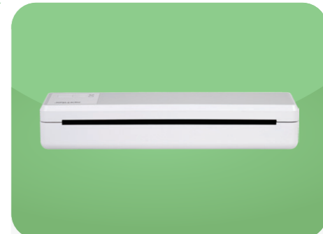
Low noise & Smooth printing