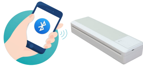
● Support Android, IOS, Windows, Mac