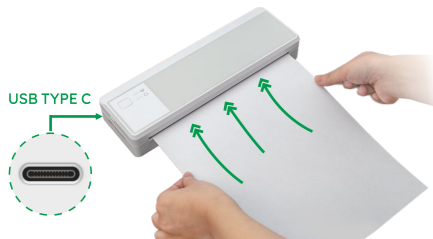
● Automatic Paper Feed, no cover opening needed