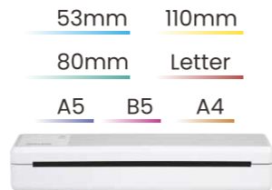
● Multi-size free switch printing