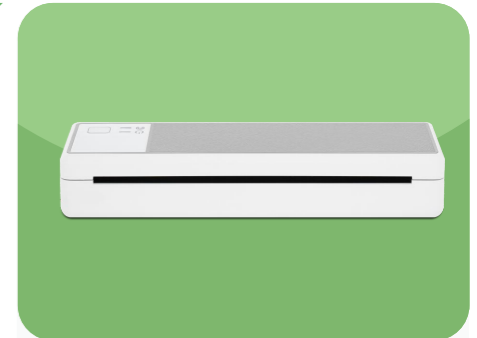
Low noise & Smooth printing