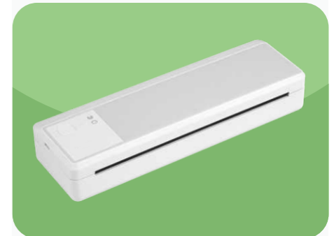
Compact & Portable