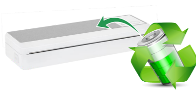
● 7.4V/1500mAh battery