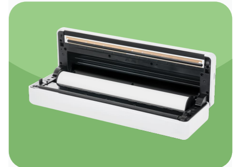
Capable of 30 mm diameter paper roll